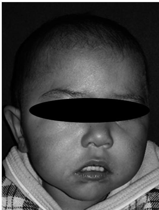
Fig. 2. Extraoral view.

At the time of the first dental examination in our clinic, the patient was receiving chemotherapy, and did not report any symptoms or discomfort related to the disease or treatment. When she was physically examined, the patient exhibited good general health status and a markedly uncooperative behavior. Except for her thinning hair, there was no evidence of abnormal extraoral signs (Fig. 2).