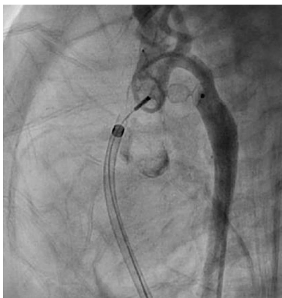
Fig. 3. Angiogram of a 3-month-old, 5.2-kg infant with arch hypoplasia, in lateral view showing a, Amplatzer vascular plug II 6-mm device used to close a 2.5-mm ductus. The device produced a significant pressure gradient between the ascending and descending aortas.

was not possible. Eventually, with an 8F short sheath, deployment of the device was successful. However, damaged vascular tissue was identified with the removed vascular sheath, and a common iliac vein injury was detected on angiogram. Therefore, the patient underwent emergent allograft surgery. A pulmonary hypertensive crisis occurred in the last patient during the procedure. Emergent intubation and monitoring in an intensive care unit after the procedure were needed.