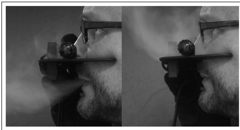
Figure 1. Exhalation of vapour against a nasometer baffle plate during the production of sustained /a/ (left) and sustained /m/ (right).

components and wiring, they can only be wiped lightly with alcohol.