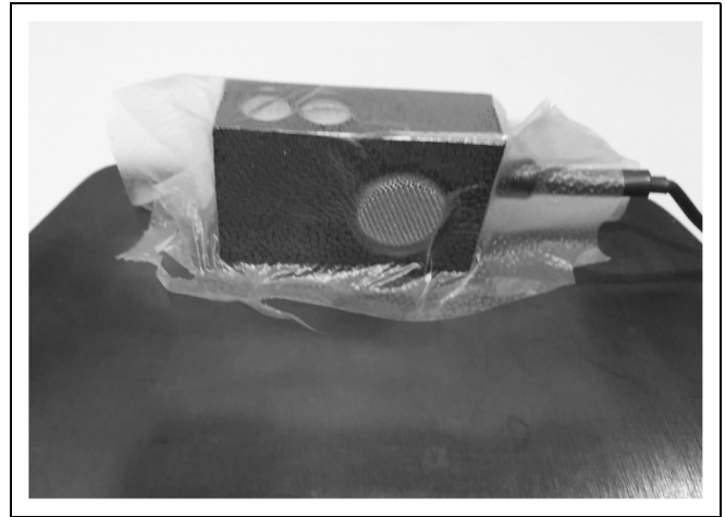
Figure 3. Nasometer microphone covered with household wrap.

pieces of Press 'n Seal. This resulted in 3 sets of recordings with wrap-covered microphones. As the last step, a final baseline recording was made with uncovered microphones.