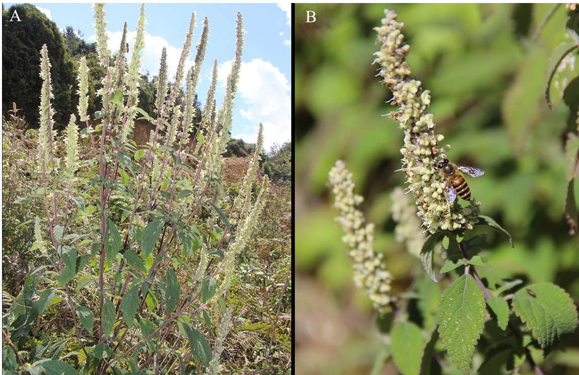
Fig 1. Elsholtzia rugulosa and its flower visitors. (A) Flowering plants of E. rugulosa . (B) Apis cerana feeding from flowers.

During the field observation period, flowers of E. rugulosa were visited almost exclusively by the Asian honey bee, Apis cerana , collecting nectar, its visitation frequency was 4.34 \pm 0.22 (times/h/flower) ( n = 41 ). Floral buds were bagged with plastic bags, these bags were taken away when the flowers open completely, after bees visiting, these styles and anthers were removed carefully and checked. The result showed that these styles have pollens of E. rugulosa , and pollens of anthers were removed. The presence of pollen grains of E. rugulosa on the heads of the Asian honey bees and the effective contact between the head of the bees and the anthers and stigmas of the flowers during nectar collecting were confirmed. In addition, the hornet ( Vespa velutina ) and a bumblebee ( Bombus eximius ) were observed to visit occasionally the