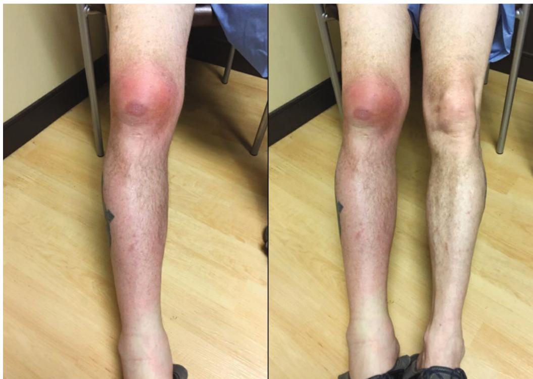
FIGURE 1: Right leg prepatellar bursitis with extension of inflammation to the upper medial thigh and lower leg.

PubMed literature search revealed no prior case reports of C. ulcerans as a cause of prepatellar bursitis with abscess. Here, we report the case of a rural hog farmer who presented with acute-onset right knee pain diagnosed with right prepatellar bursitis with abscess due to C. ulcerans infection.