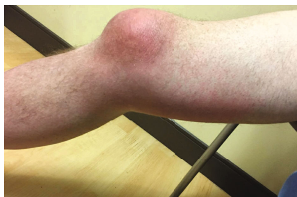
FIGURE 2: Lateral view of the right knee joint revealing right knee prepatellar bursitis with extension of inflammation.

A 53-year-old male patient presented to the orthopedic clinic at our institution for new-onset right knee pain of two-day duration. His past medical history was significant for type two diabetes mellitus, acid reflux disorder, chronic obstructive pulmonary disease, and left shoulder osteoarthritis. His smoking history consisted of 1.5 packs per day with 40 pack-years with no alcohol or substance abuse. He is a self-employed hog farmer. One day before the presentation, he noticed progressive soft tissue swelling over the right knee with erythema extending from the midthigh down to below the knee. The right knee pain was described as intense and sharp with a grade of 10/10 with radiation to the right hip and difficulty in right lower extremity weight-bearing. There were no associated fevers, chills, night sweats, nausea, vomiting, or change in left shoulder pain. There was no history of right knee trauma, gout, or intra-articular steroid injection. His job demanded him to be on his knees during the day. A general observation revealed a middle-aged male in mild distress. Clinical examination showed stable vital signs and an antalgic gait. The direct clinical inspection was notable for right lower extremity diffuse swelling from the midthigh to the foot along with significant erythema (Figures 1 and 2). Palpation revealed tenderness over the superior portion of