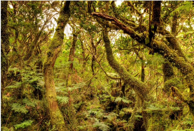
Figure 2. doi

Figure 1. Location of plots in Pico (left) and Terceira (right) islands.