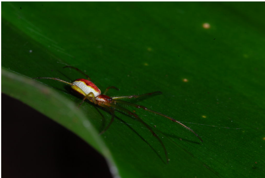
Figure 4. doi

Rugathodes acorensis Wunderlich, 1992.