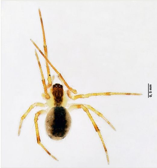
Figure 3. doi

Rugathodes acorensis Wunderlich, 1992.