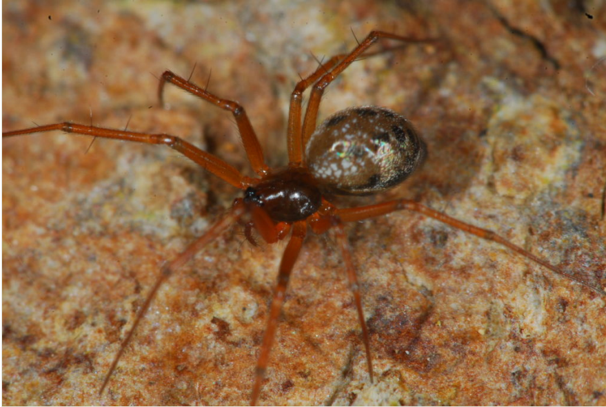
Figure 5. doi

Tenuiphantes miguelensis (Wunderlich, 1992).