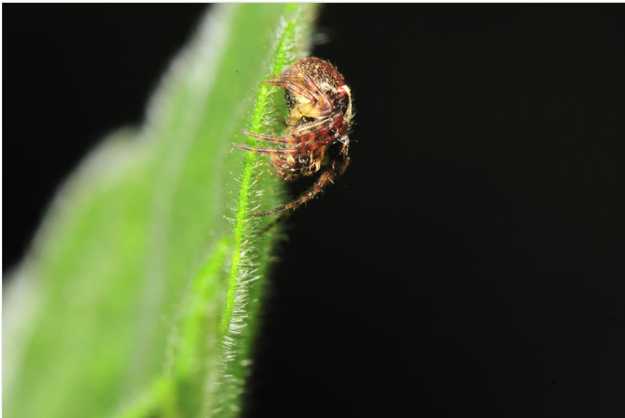
Figure 6. doi

Tenuiphantes miguelensis (Wunderlich, 1992).