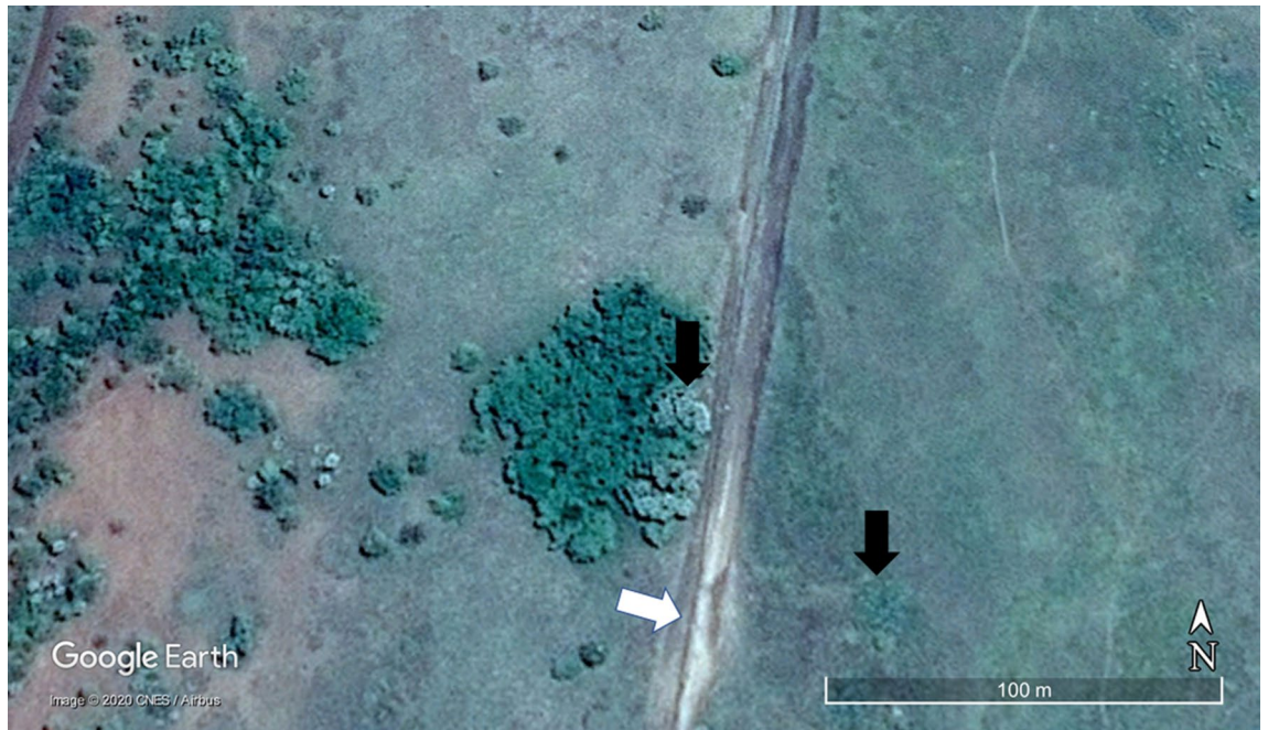
Figure 2. Arrows indicate that on Google earth image (Image 2013 CNES/Airbus) of where Fig. 1 was taken, tall palms are clearly visible within the enclosure (grey-green canopies) but are short outside the fence.