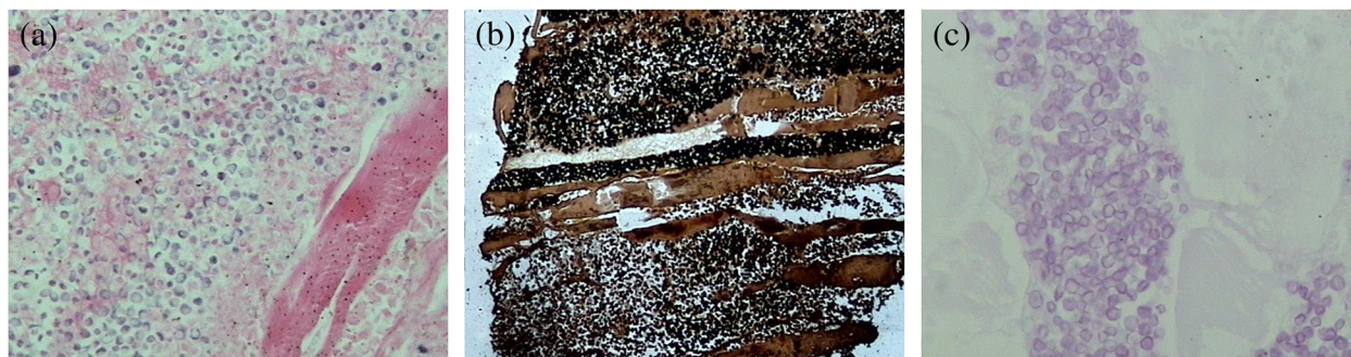
Figure 3 A histopathological analysis of muscle tissue showed focal necrosis with inflammatory cell infiltration and diffuse fungal spores among the muscle cells. (a) hematoxylin and eosin stain, \times 100 ; (b) Grocott's methenamine silver stain, \times 100 ; (c) periodic acid-Schiff stain, \times 400 .

Apart from the treatment of aspergilloma in fibrocavitary lung disease with intra-cavitary amphotericin B [9-11] and Candida joint infection with intra-articular amphotericin B [12,13], the local administration of antifungal drugs for IFIs is uncommon. Itraconazole was registered for use in 1991 and is widely used to treat several forms of mycosis; however, to the best of our knowledge this is the first case report of the use of intra-lesional itraconazole for fungal myositis.