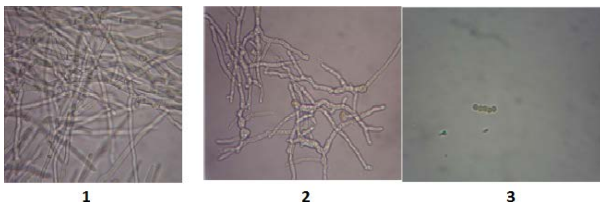
Figure 1. Effect of vitamin C on the growth rate of fungal suspension; 1) concentrations of 25 mg/ml, 2) concentration of 50 mg/ml, and 3) concentration of 100 mg/ml (As seen in the picture, the amount of fungal mass decreases with the enhancement of vitamin C concentration.)

To investigate the effect of vitamin C on afIR gene expression, after culturing fungal suspension in the medium containing vitamin C, RNA extraction was carried out according to the protocols mentioned above. Agarose gel electrophoresis experiment confirmed the accuracy and integrity of RNA extraction. Then, RT-PCR was performed using SYBR Green method. The obtained melt curves showed the specificity of the primers. The results of this study demonstrated that gene expression decreased to 68.7% and up to 81% at the concentrations of 25 and 50 mg/ml, respectively (Figure 2).