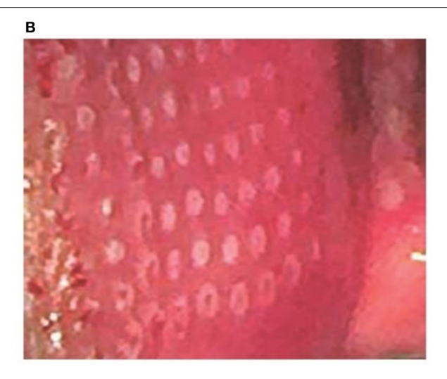
FIGURE 1 | The electrode is parallel and lightly touching the mucosa and the subsequent microablations. Adapted from Sarmento et al. (7). (A) Radio frequency application. (B) Vaginal mucosa after radiofrequency application.