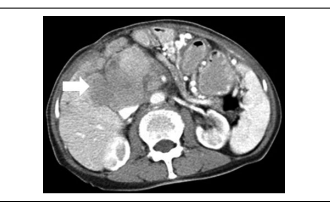
Figure 1. Preoperative contrast-enhanced computed tomography (CT) scan in a 74-year-old woman showing a 7.3 \times 7.0 \times 7.5 cm mass in retroperitoneal inferior vena cava near the portal triad (arrow), which was due to a malignant fibrous retroperitoneal sarcoma.