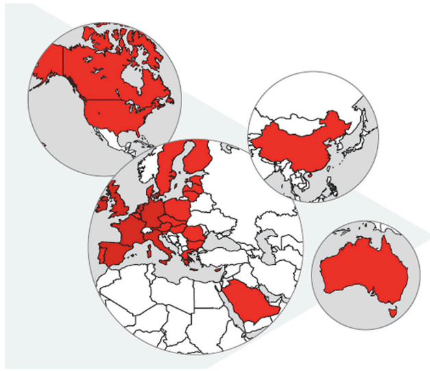
Figure 3. Map of the IRDiRC

The IRDiRC was formally launched in 2011 and currently includes member institutions from Asia, the Middle East, Australasia, Europe, and North America. The current cumulative commitment from the 42 member institutions from both the public and private sectors is estimated at more than $2,000,000,000 USD.