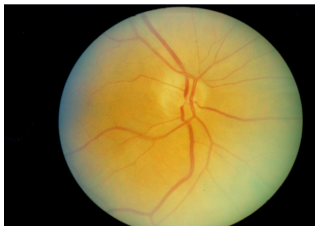
Figure 1 Colour fundus image of the right eye.

Bowel ischaemia or infarction secondary to involvement of the mesenteric arteries has been reported as a rare extracranial feature of GCA [4]. The blood supply to the pancreas is from the splenic, gastroduodenal and superior mesenteric arteries [5], however, it is unlikely that GCA is the cause in this patient. The pancreatitis started after 8 days of high-dose steroid treatment, there was no evidence of bowel perforation on abdominal X-ray and the pancreatitis settled with conservative treatment and has not reoccurred after 8 months of follow-up. Another possibility is that the pancreatitis could be secondary to dis-