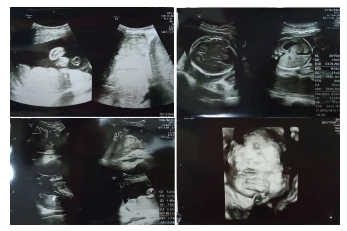
Figure 1. Fetal ultrasonography shows a single living intrauterine fetus with active movements (November 21, 2022).

A 34-year-old pregnant female at 24–25 weeks of gestation presented to Department of Obstetrics and Gynecology at Dr. Zainoel Abidin Hospital, Banda Aceh, Indonesia on November 22, 2022 with a chief complaint of heartburn and pain radiating to the back. Previous medical history reported that the patient had liver enlargement; however, the patient declined any history of hepatitis. The patient also complained of a palpable mass on the upper right quadrant of the abdomen. The patient's obstetrics history revealed G4P2A1, with a single living intrauterine fetus and active fetal movements based on ultrasonography (USG) November 21, 2022 ( Figure 1 ). There was no weight loss, spotting, and amniotic discharge. A history of gestational abortion was in the first pregnancy by curettage in 2014. Following that, the patient underwent cesarean delivery (C-section) twice. The patient has a history of NPC stage II based on clinical examination and anatomical pathology findings with non-keratinizing squamous cell carcinoma and received one complete series of chemoradiation in October 2022.