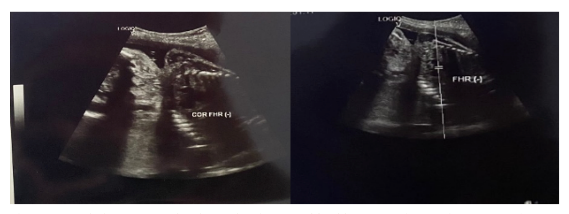
Figure 3. Fetal ultrasonography shows the absence of fetal heart rate (November 29, 2022).