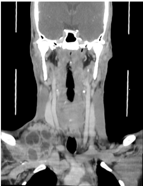
Fig 4. CT scan from a 22-year-old patient with HS after 2 months of antituberculosis treatment. CT image of the neck shows right level VI and bilateral level V lymphadenopathy, the largest confluent with a hypodense center, suggesting necrotic degeneration at the right supraclavicular fossa.

been associated with an increased risk of TB, 4 which may be caused by (1) the lack of T cell and macrophage recruitments mediated by TNF- \alpha to the site of infection and, therefore, the failure of granuloma formation 5 or (2) blockage of TNF- \alpha downregulating the inducible nitric oxide synthase in macrophages and its antimicrobial activity against infections such as TB. 6