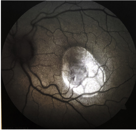
Fig 3. Subretinal granuloma images from a 22-year-old patient with HS after 5 months of adalimumab treatment. Fluorescein angiography of the left eye image shows progressive hypofluorescence areas in the macular region suggestive of granuloma with serous retinal detachment.