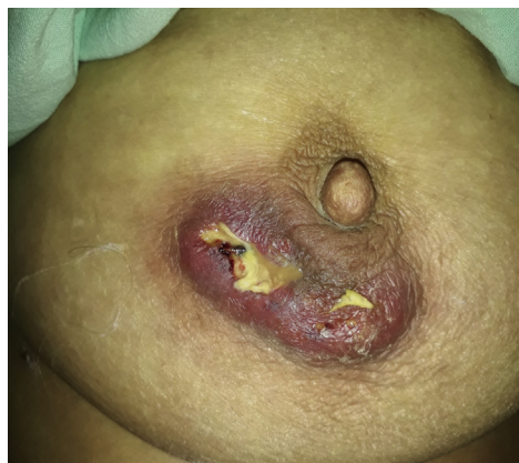
Fig 1. Clinical image from a 69-year-old patient with psoriasis and psoriatic arthritis after 4 months of adalimumab treatment. The image shows subareolar abscess with purulent drainage on the right breast.