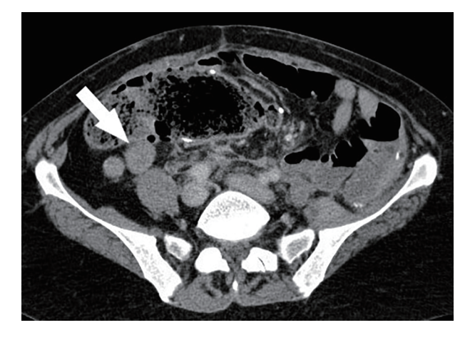
Figure 1. Computed tomography (CT) of abdomen/pelvis in 2015 prior to trabectedin with a representative abdominal liposarcoma metastasis (white arrow).

at previous measurements. Treatment was interrupted after 32 cycles for an episode of syncope and fall with ankle fracture necessitating surgical internal fixation and time for rehabilitation. Her symptoms were attributed to food poisoning and not chemotherapy, resulting in a 3-month delay in chemotherapy, but her disease remained stable. After 38 cycles, a mixed response was seen. Further regression was seen with regards to the left subdiaphragmatic mass now measuring 1.7 cm and a left peri-rectal nodule now 6 mm. The anterior abdominal wall mass was stable at 4.2 cm (Fig. 3). The right infrarenal mass had grown to 3.9 cm however. A radiation oncology consult was elicited but with a single kidney radiation was felt too risky to attempt. Trabectedin was briefly continued. Further growth of the infra-renal metastasis to 4.7 cm occurred.