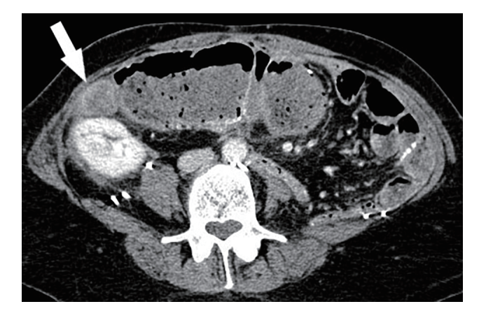
Figure 4. Computed tomography (CT) of abdomen/pelvis in 2020 revealed a new peritoneal metastasis despite trabectedin chemotherapy near a prior abdominal surgical bed. The lesion approximates bowel and right kidney (white arrow).

failed to return for cycle 50 for a 6-month period. The patient was contacted multiple times and eventually returned. She stated she had a depressed episode. No new symptoms or exam findings were presented. Restaging showed continued stable low volume disease, and she resumed surveillance. By 9 months off treatment the patient had progression with the larger anterior abdominal wall mass measuring 4.6 cm (previously 2.6 cm) and the newer abdominal metastasis now 2.8 cm (previously 1.5 cm). Other areas remained unchanged. She again resumed trabectedin. Unfortunately these two metastatic sites continued to grow after another two cycles. Given dissatisfaction of this cosmetically, she was seen by surgical oncology at her current academic cancer center and undertook resection of the two anterior abdominal wall masses. Poorly differentiated sarcoma was noted on pathologic review. Margins were not completely cleared, but after two more cycles of chemotherapy, the area of resection and other metastatic sites continued to remain stable. A CT scan in the summer of 2020 showed stable findings except an enlarging right-sided (R-sided) abdominal wall mass of about 1 cm and a 2.2 cm