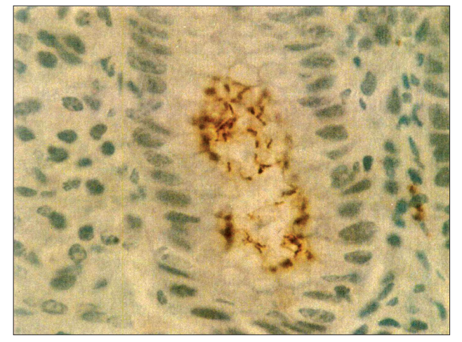
Figure 3: Photomicrograph showing Helicobacter pylori grade 3+ (IHC, 1000×)

372 Volume 18, Number 6 Dhul Hijjah 1433H November 2012