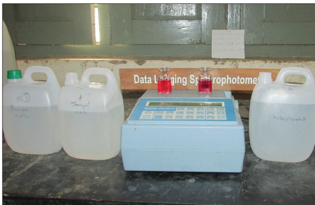
Graph 1: Water sample analysis for fluoride Using Orion 9609BN

Analysis of the obtained results was carried out by four statistical tests. Analysis of variance (ANOVA) was done to test the significant difference in IQ levels based on fluoride concentration. Student's t -test was done to test the significant gender-based difference in IQ levels of three villages with three different fluoride concentrations in drinking water. Kruskal–Wallis ANOVA was done to test the significant difference in distribution of IQ grades with children in the low, medium, and high-fluoride areas. Correlation was evaluated using Spearman's rank correlation coefficient.