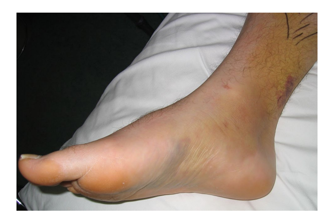
Fig. 1 Acute deltoid ligament injury. Patients usually present with ecchymosis, swelling, and tenderness along the medial part of the ankle joint. Weight bearing may be impossible due to pain and instability

in getting the diagnosis is the tenderness at the medial gutter of the ankle joint [22]. Not only the injured ligaments themselves but also the synovitis of the medial part of the ankle joint are responsible for this anteromedial pain. The drawer test and the talar tilt test may be positive. Clinically the patient may present with a flatfoot with prominence of the medial malleolus, pronounced hindfoot valgus and pronation of the affected foot. In contrast to patients with a tibialis posterior tendon dysfunction, the patients are able to actively correct