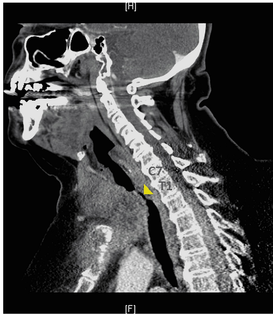
FIGURE 1: Sagittal CT image of the chest

Tracheal stenosis (yellow arrow tip) is visible at the inferior C7 and T1 vertebral levels.