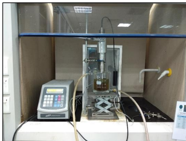
Figure 1. Ultrasonic probe system setup.

Dried pandan powder was weighed according to the desired mass using an electronic balance and stored in a 500 mL ultrasonic vessel. The solvent used in this process was ethanol and distilled water ( v/v )%. 200 mL of solvent was poured into the vessel. The vessel was then connected to a refrigerated water bath at a temperature of 35 °C to help to maintain the process temperature. The setup for the ultrasonic system is shown in Figure 1 below, while the specification is shown in Table 1 below.