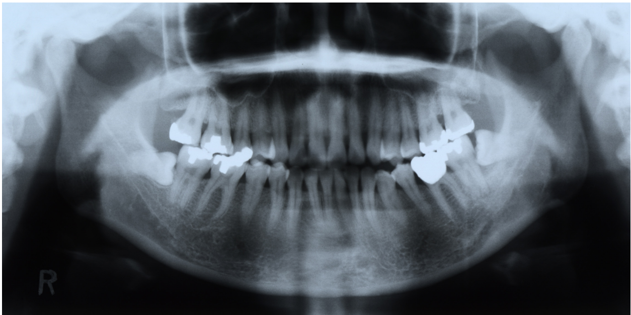
Figure 1 Right horizontal incompletely impacted third molar with lamina dura without radiolucency below the crown in a 38-year-old woman.

by a fully or partly uniform line as still present, even if the line was partly irregularly ruptured. Absence of the lamina dura was defined as no detection of a white line below the crown. On the other hand, the degree of bone resorption at the mesial surface of the canine and the first molar was assessed for aging or periodontal disease. Exposure of the root surface of the teeth was measured from the cemento-enamel junction to the alveolar crest at the mesial site of the teeth, and exposure of the root surface was calculated as a fraction of