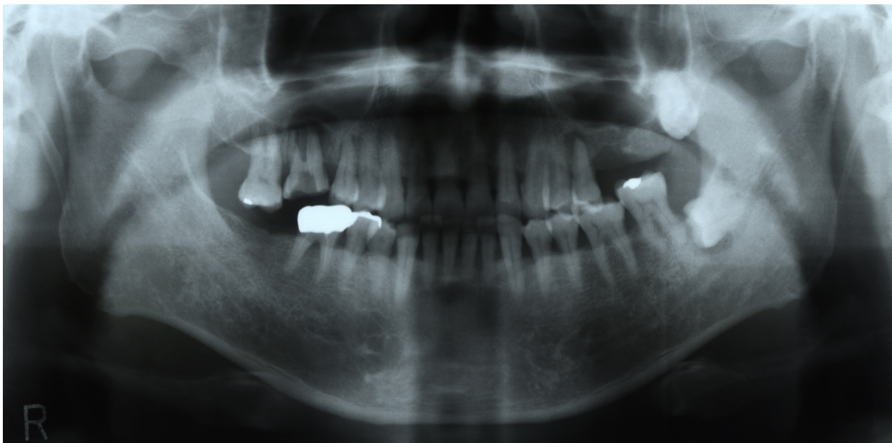
Figure 2 Left horizontal incompletely impacted third molar without lamina dura with radiolucency below the crown in a 51-year-old man.

the root length as determined radiographically. The mean \pm SD rate of bone resorption between the first and second measurements in the canine and first molar was calculated, with the mean \pm SD in those teeth in relation to the ipsilateral third molar, and grouped into categories with or without the lamina dura and the radiolucency below the crown of the third molar. Imperfect views of the root because of imbrication of individual roots due to curvature of the dental arch were excluded from the assessment. When assessment of