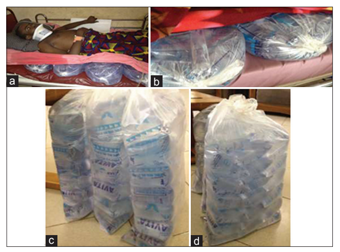
Figure 1: (a-d) Plastic sachets of table water in bags forming improvised water hed