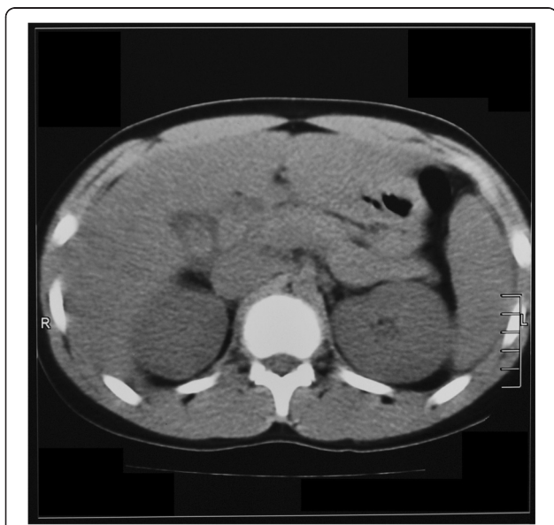
Figure 2 Non-contrast CT Abdomen of the patient demonstrating prominent edematous pancreas, pericholecystic fluid along with hepatomegaly.

Additionally in a clinical setup, when a patient presents with acute pancreatitis alone as in this case, leptospirosis might not be considered as an aetiology in the initial work-up because of the rarity. Later the patient may develop multi-organ failure due to leptospirosis, yet that might be attributed to the multi-organ involvement of acute pancreatitis. Ultimately, recognition of leptospirosis might get delayed compromising the optimum management.