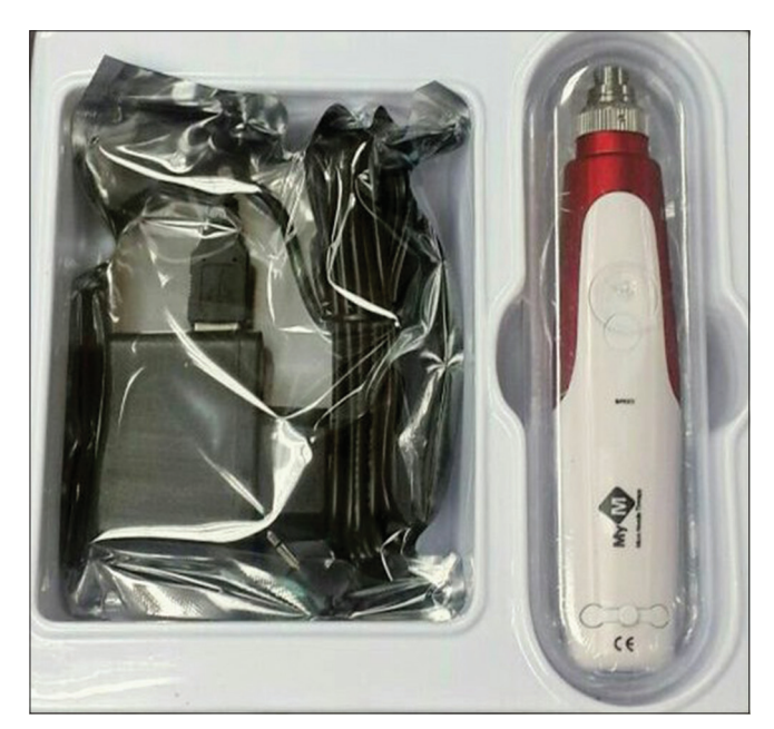
Figure 3: Dermapen with battery charger

DermaFrac treatment is a newer modification of microneedling combining microdermabrasion, microneedling, simultaneous deep tissue serum infusion, and light emitting diode (LED) therapy. DermaFrac treatments target aging and sun damaged skin, acne, enlarged pores, uneven skin tone, wrinkles,