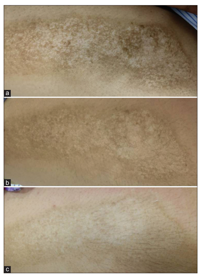
Figure 5: Post-burn scar on the thigh of 1 year duration treated with a combination of microneedling and laser (a) Baseline photograph; (b). Scar showing improvement after 3 fortnightly sessions of microneedling; (c) Further improvement in scar following 1 session of Fraxel laser RE: STORE SR 1500nm (Solta Medical, USA) with following parameters: 70 mj beam energy, 20% density, 8 passes.

has been combined with various skin lightening agents and chemical peels to reduce melasma as well as periorbital hypermelanosis [Table 6].