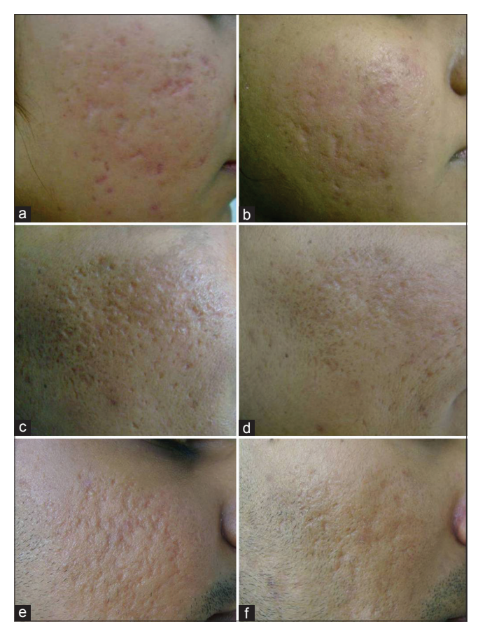
Figure 4: Pre (a, c, e) and post (b, d, f) treatment photographs of post-acne atrophic scar patients after 4 sittings of microneedling done 1 month apart