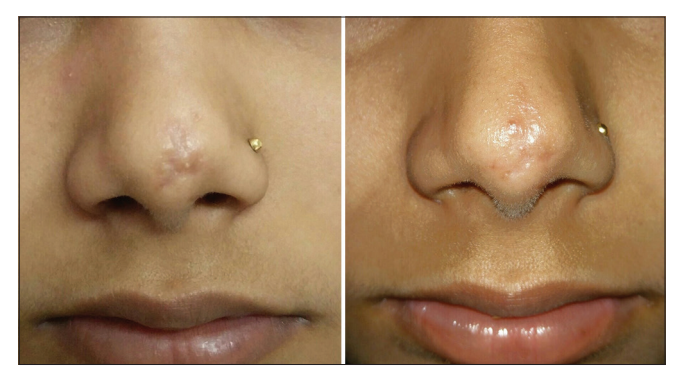
Figure 7: Significant improvement in post-traumatic scar over the nose after 1 sitting of subcision followed by 3 sittings of microneedling done 1 month apart