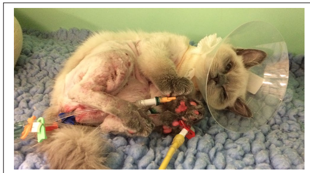
Figure 2 Enteral nutrition was administered by constant rate infusion via the oesophageal feeding tube

On day 3, the kitten started to eat small quantities of kitten food (Hill's Science Plan Kitten) when offered by hand. The calories ingested voluntarily were minimal and O-tube feeding continued at 100% of the calculated RER. Neutropenia resolved on day 4 (Table 1); however, the pyrexia persisted, with the rectal temperature fluctuating between 39.3°C and 40.5°C. In the absence of documented