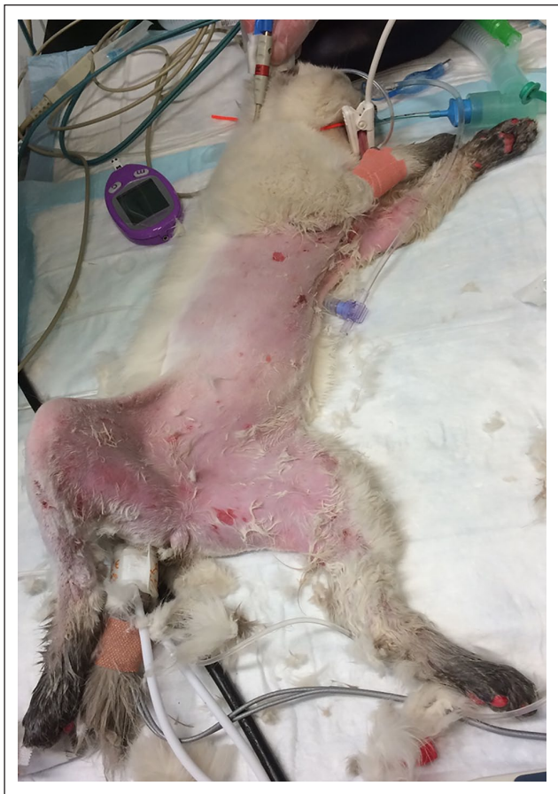
Figure 1 Clipping of the haircoat following admission revealing scalding and erythema of the ventral thorax, abdomen, thoracic/pelvic limbs and perineum with areas of ulceration

Haematology and biochemistry panels sampled on admission revealed a non-regenerative mild anaemia, neutropenia, hypoalbuminaemia, hypocholesterolaemia and increased alanine aminotransferase (ALT) activity (Table 1). On day 2, the kitten remained pyrexial at 39.9°C. The urinary catheter was removed and the central venous catheter was replaced as it had been removed by the patient. Pyrexia persisted despite new vascular access. No erythema or discharge of the O-tube site was detected on daily assessment. Urinalysis indicated no evidence of urinary tract infection and urine culture demonstrated no microbial growth. IV potentiated amoxicillin 20mg/kg q8h (Augmentin; GlaxoSmithKline) was initiated on day 3.