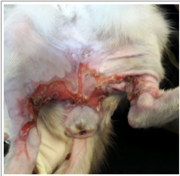
Figure 5 Incomplete healing of skin lesions 5 days after discharge from the hospital

Plan Kitten) and increase the amount of food offered if there was a decrease in body weight. Body weight was 1.4 kg vs 1.53 kg on admission. BCS was 3/9 vs 4/9 on admission and the muscle condition score had decreased from 2/3 to 1/3.