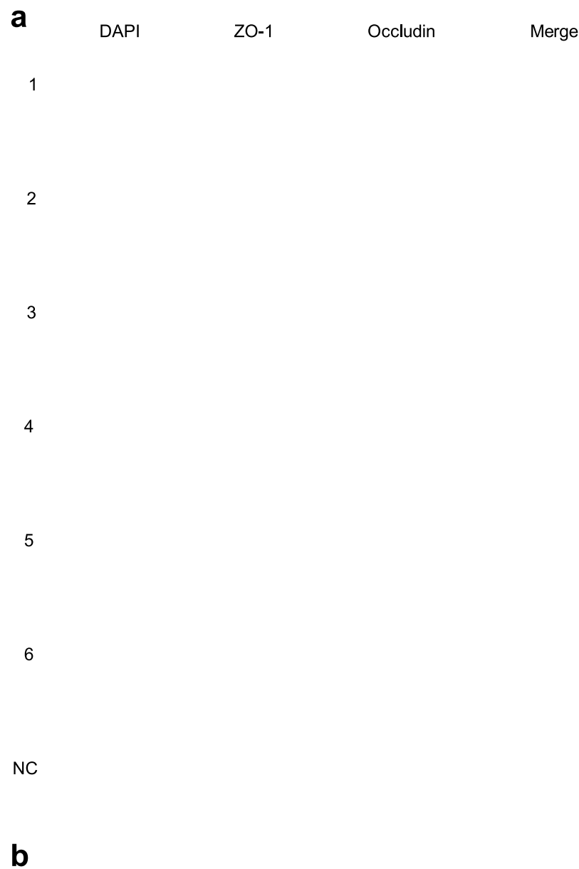
Fig. 1. Panel (a) shows representative images of the immunofluorescence staining of corneal epithelial cells collected from cadavers with different postmortem intervals. NC, negative control; scale bar = 50 \mu m. Panel (b) shows magnified images of the cells in group 2.

Although the prevalence of dry eye increases with age 23 , it could not be determined whether every cadaver has some eye disease.