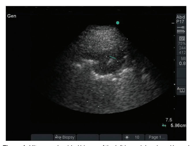
Figure 1: Ultrasound-guided biopsy of the left lower lobe pleural based lesion as seen on computed tomography scan

US-guided biopsies were performed using a Micro Maxx (Sonosite Inc., Bothell, WA, USA) unit equipped with a 1–5-MHz phased array transducer. The patients were placed in a comfortable position depending on the tumor location and patient preference, which included supine, lateral decubitus, or sitting upright with arms resting on a table. The lesion was located by scanning the intercostal spaces, and Doppler was used to certify the absence of blood vessels in the biopsy path. The biopsy site was disinfected with ChloraPrep (2% chlorhexidine, 70% isopropyl alcohol; Enturia Inc., Leawood, KS). Under local anesthesia and real-time guidance with US, fine needle