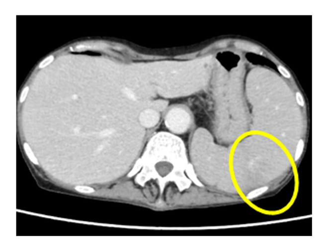
Figure 6. Abdominal contrast-enhanced CT (prior to the transition to best supportive care). A wedge-shaped low-density lesion is observed in the spleen (yellow circle). Exacerbation of splenomegaly and splenic infarction were suspected.

Linenberger (14), of 2,992 cases of adverse events linked to rhG-CSF preparations, 15 (0.5%) included splenomegaly; in addition, Aubrey-Bassler and Sowers (15) reported that, of 613 cases of splenic rupture, 10 (1.6%) were associated with rhG-CSF preparations. There are several case reports of splenic rupture and infarction when rhG-CSF preparations were administered to patients with cancer for the purpose of treating or preventing myelosuppression by chemotherapy and to healthy donors prior to stem cell transplantation (16-19). However, the PubMed search revealed no reports of splenomegaly hypothetically associated with G-CSF produced by solid tumors, other than the present case and a previously reported case by de Wolff et al (20). The study of de Wolff et al did not report the serum G-CSF levels over time, and there was no evidence that metastatic melanoma produced G-CSF. The authors suspected that melanoma was producing G-CSF as the cause of leukocytosis. Moreover, in their study, the findings of chest and abdominal CT examination suggested lung, liver and spleen metastases; therefore, they did not associate melanoma-produced G-CSF with splenomegaly, unlike our report.