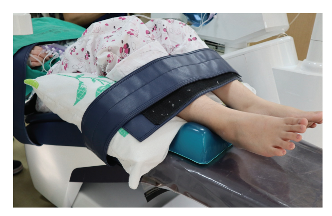
Fig. 1. Pillows are placed under the knee and secured to the bed with a restraining band during general anesthesia of a patient with complex regional pain syndrome

In the operating room, intravenous access was established with a 22-gauge cannula on the left arm. Electrocardiography leads or blood pressure cuffs were not applied because of possible pain. Only pulse oximetry was performed. General anesthesia was induced with propofol and remifentanil. In addition, dexmedetomidine was infused continuously to reduce pain. Therefore, pain at the dental treatment site and throat pain due to endotracheal intubation were tolerable. Patient did not