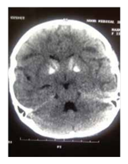
Fig 3. Brain CT scan shows bilateral calcification in basal ganglia, periventricular demyelination and mild dilatation of lateral ventricles.