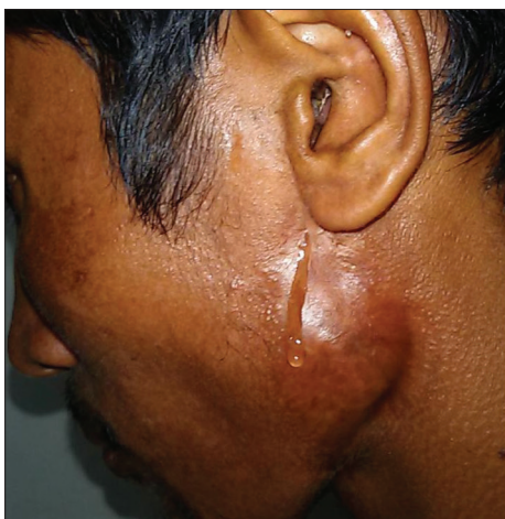
Figure 1: Parotid fistula and Frey's syndrome

BTX injections are usually effective in several patients with Frey's syndrome. [14] Mainly, BTX-A is used for salivary gland