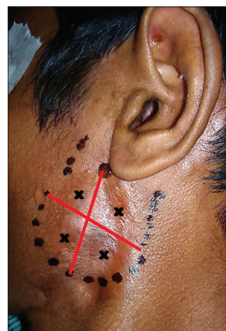
Figure 2: The parotid region is divided into four quadrants. The injection points are at 1 cm from each other