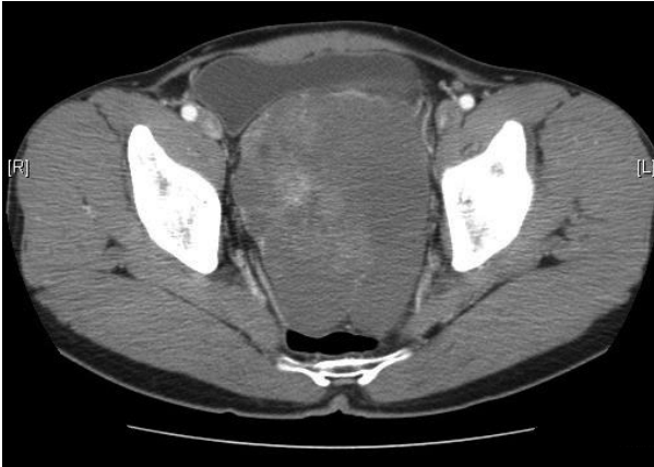
Fig. 1. Computer tomography shows about a 13.7 cm solid and cystic mass in the pelvic fossa.

semisolid (4 cm in diameter) with semicystic changes (5 cm in diameter) and had multifocal hemorrhagic foci. The microscopic findings showed hyperplastic epithelium lined cysts with leaf-like intraluminal epithelia lined stromal projections. Compressed and elongated slit-like epithelial lined spaces had less than 2 mitotic counts/10 HPF, low-to-moderated cellularity and mild-to-moderate cytoplasm atypia. The immunohistochemical stains were positive for CD34 and actin, focally positive for desmin and negative for NSE, S-100, and CD 56 (Fig. 2). The final pathological results were consistent with a phyllodes tumor of the prostate, a low-grade tumor. Twenty-eight months after surgery, the patient was well without recurrence or metastases.