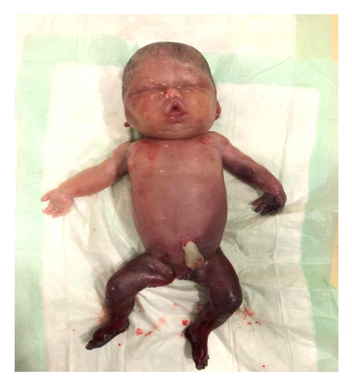
Figure 3. Macroscopy of the fetus showing generalized massive edema.

A stillborn fetus was delivered vaginally after 9 h of labor. The autopsy revealed a female fetus, appropriate for gestational age (28 weeks' gestation), with systemic edema (Figure 3). There was no evidence of external or internal malformations. The placenta weighed 751 g (>90th percentiles for 28 weeks' gestation) and presented a marginal cord insertion at 1 cm from the disc edge.