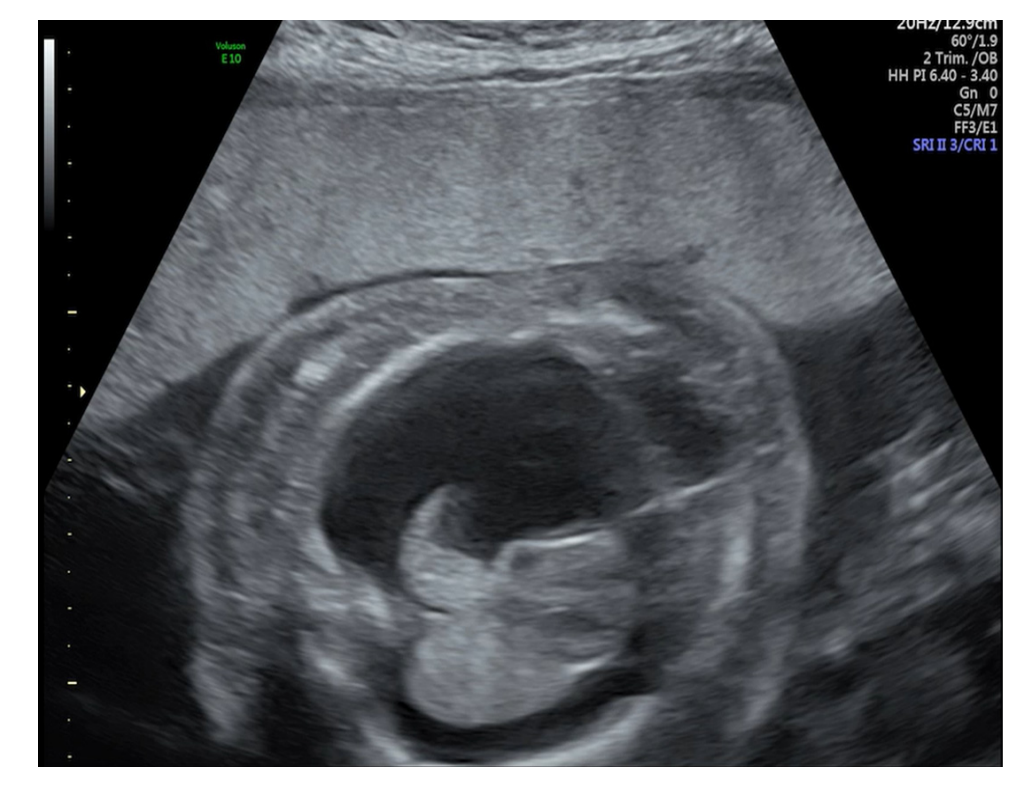
Figure 1. Transverse abdominal section of the thorax showing skin edema and thoracic effusion.

A routine ultrasound examination (US) performed at 25 weeks' gestation revealed hydrops fetalis with skin edema and severe thoracic and abdominal effusion (Figure 1). As she was Rhesus (RhD) negative and her husband was positive, with negative anti-RH antibodies, a dose of Anti-D immunoglobulin was administrated. No anemia was detected during pregnancy. A thoracocentesis and amniocentesis were performed. Cytogenetic analysis revealed a normal female karyotype. Because the evolution did not improve, another thoracocentesis and a percutaneous in utero thoracoamniotic shunt was placed in the left hemithorax at 26 weeks' gestation (Figure 2). However, the evolution remained stationary, and at 28 weeks, the obstetric US confirmed fetal death.