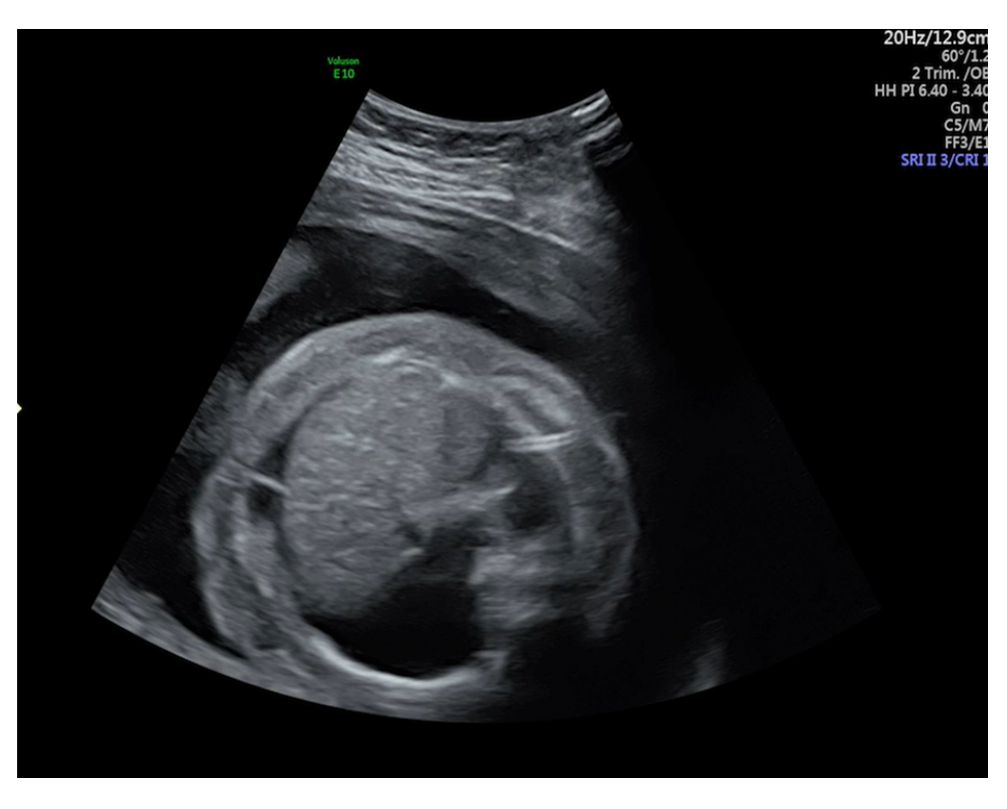
Figure 2. Transverse abdominal section revealing ascites and the presence of percutaneous thoracoamniotic shunt.

A stillborn fetus was delivered vaginally after 9 h of labor. The autopsy revealed a female fetus, appropriate for gestational age (28 weeks' gestation), with systemic edema (Figure 3). There was no evidence of external or internal malformations. The placenta weighed 751 g (>90th percentiles for 28 weeks' gestation) and presented a marginal cord insertion at 1 cm from the disc edge.