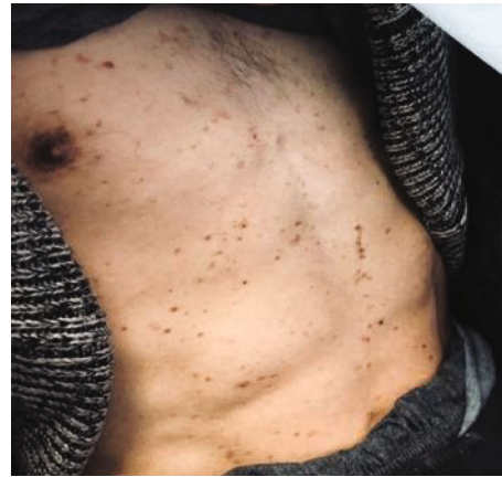
FIGURE 6: First visit to our clinic. Numerous dark red purpuric maculopapular lesions.

Oral hygiene was very poor due to difficulties in oral care because of the pain associated with the mucosal