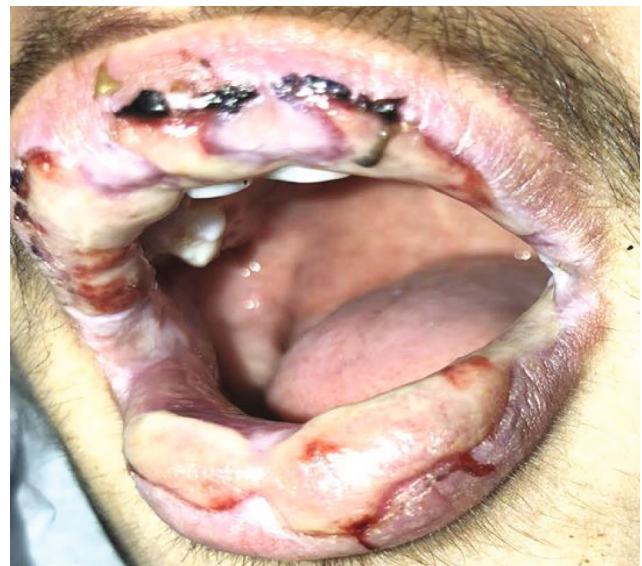
FIGURE 7: 10 days after initial treatment with prednisone: bullae and crusts with vermilion-colored tissue.

lesions. The bilateral submandibular lymph nodes were enlarged and tender.