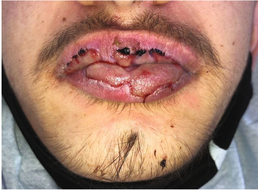
FIGURE 8: 10 days after the first visit. Thick hemorrhagic crusts over the labial lesions and bullae.