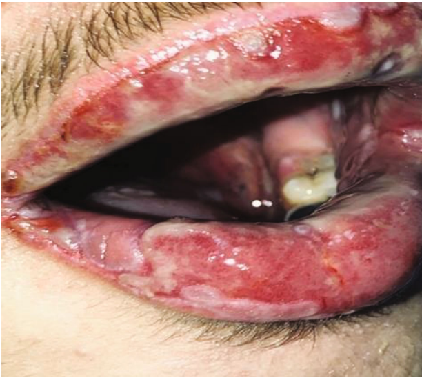
FIGURE 4: First visit to our clinic. Lip lesions with a tendency to bleed.