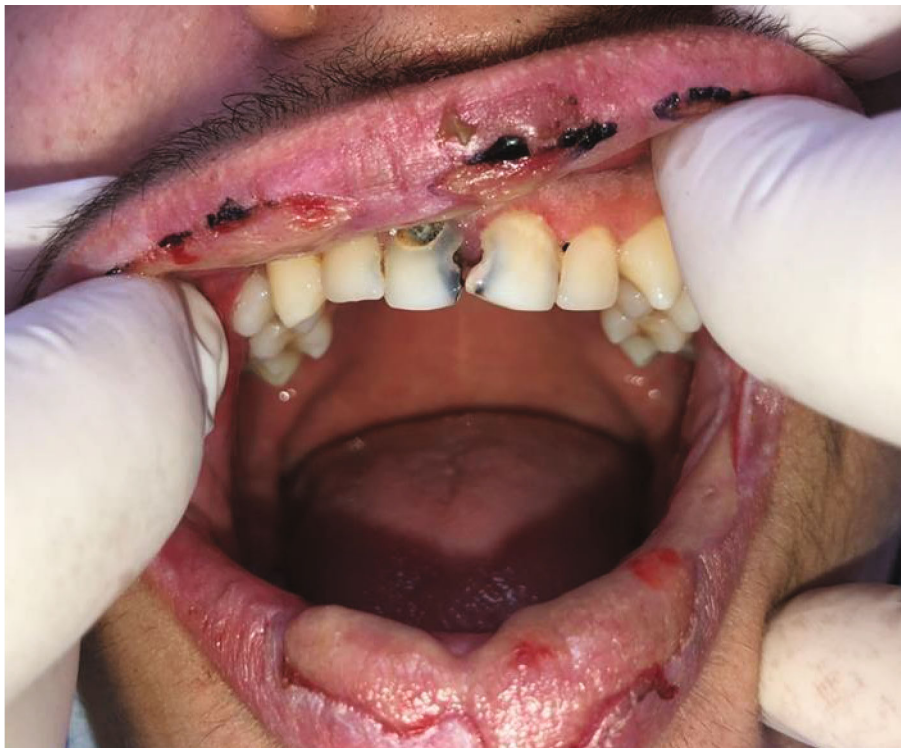
FIGURE 9: 10 days after the first visit. Oral lesions only on the lips and labial mucosa.

Leukocytes 11.51 (reference 10 \mu\text{L} ), C-reactive protein 7.2 mg/L (reference < 5 mg/L), erythrocyte sedimentation rate 16/32 mm/h (reference 3-15 mm/h), and D-dimer level 0.850 \mu\text{g/mL} FEU (reference < 0.500 \mu\text{g/mL} FEU).