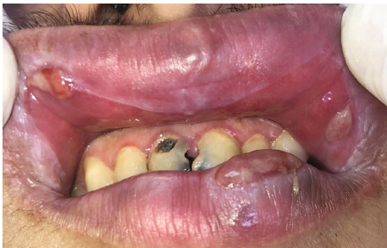
FIGURE 10: 3 weeks after the first visit. Vesicles on the mucosa of the upper lip and bullae on the lower lip.