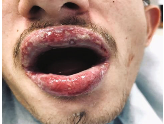
FIGURE 2: First visit to our clinic. Lesions extending to the oral mucosa.

In this paper, we present a case of EM in a 17-year-old male patient with oral lesions who was confirmed to be positive for SARS-CoV-2 by reverse transcriptase-polymerase chain