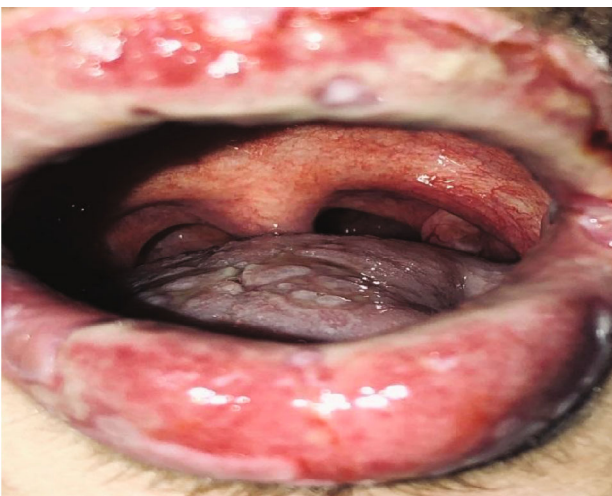
FIGURE 5: First visit to our clinic. Intraoral white coating on the tongue and redness of the isthmus faucium.

lesions on the oral mucosa, and the clinical presentation consisted of EM-like lesions (Figures 3–5). At the time he presented at our clinic, pulmonary signs, such as cough and dyspnea, were absent, but numerous dark red, purpuric, irregular maculopapular lesions were present on the patient's abdomen (Figure 6). The patient had no complaints regarding the skin changes. Mucosal vesicles or bullae on the lips had ruptured and left the surfaces covered in thick white or yellow exudates, and ulcerations with bloody crusting were observed (Figures 7 and 8). The ulcerations were painful. The lesions were mainly associated with areas of poor oral hygiene. During the clinical examination, increased salivation was observed, which from time to time, according to the patient, was accompanied by blood.