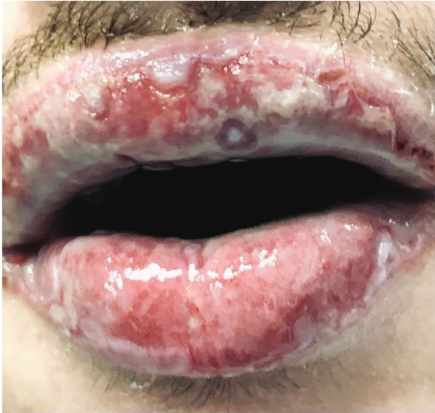
FIGURE 1: First visit to our clinic. Irregular ulcerations with whitish fibrin coating over vermilion-colored tissue.

become gradually enlarged, forming plaques several centimeters in diameter. The central portion of the papules or plaques gradually becomes a dark red or brown color or purpuric. Crusting or blistering sometimes occurs in the center of the lesions. The diagnosis of EM relies on clinical indicators, and bloodwork may reveal mild leukocytosis, neutropenia, or mild anemia. Electrolyte values may be altered if the patient is dehydrated [16].