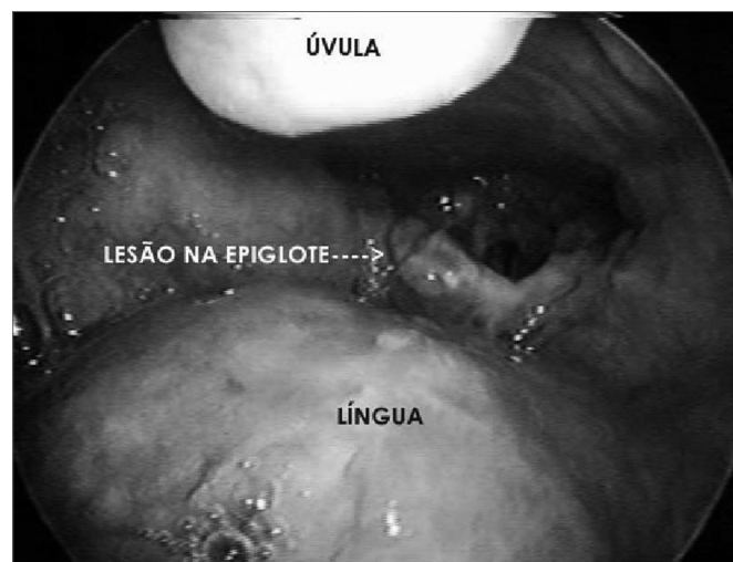
Figure 1. Lesion on the right upper surface of the epiglottis - laryngeal histoplasmosis.

The patient came with hoarseness, progressive dysphagia, and having lost 10Kg in 2 months. He had had AIDS since 1996. At admission his blood work up showed 2 CD4 + lymphocytes per mm 3 . Direct laryngoscopy was carried out and showed a white necrotic lesion spread throughout his larynx, edema and exophytic lesion in the upper right border of the epiglottis. We biopsied the lesions. We did not observe lesions on the skin. His adrenocortical, myelogram, CSF, ecocardiogram and skull CT scan were all normal. The result was histoplasmosis. The