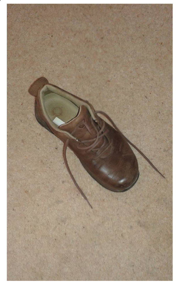
Fig. 2 Nigel's shoe

great grandmother in her eighties who was very resistant to attempts by podiatrists to encourage her to wear more supportive shoes: