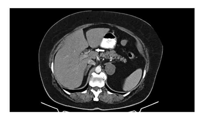
Figure 2. Computed tomography scan showing enlarged hilar lymph nodes (arrow).