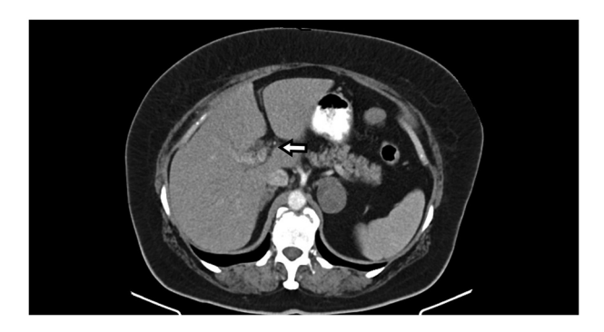
Figure 3. Computed tomography scan showing dilatated intra-hepatic ducts (arrow)

Technologies, Inc.), MYC (mouse monoclonal, clone EP121, 1:50 dilution; Bio SB, Inc.), CD30 (mouse monoclonal, clone BER-H2, 1:50 dilution; Dako; Agilent Technologies, Inc.), Ki67 (mouse monoclonal, clone MIB-1, 1:200 dilution; Dako; Agilent Technologies, Inc.) were used (6). For antigen retrieval, slides were immersed in a high pH Dako EnVision Flex Target Retrieval Solution (50X, cat. no. DM828; Dako; Agilent Technologies, Inc.) at 97°C for 20 min and endogenous peroxidase activity was blocked using the Dako EnVision FLEX Peroxidase Blocking Reagent before antibody incubation (cat. no. SM801; Dako; Agilent Technologies, Inc.) (6). Immunohistochemistry was performed using the Dako Autostainer Link 48 device, with EnVision™ detection and visualization kit (cat. no. K5007) and Dako EnVision DAB + Chromogen Flex substrate buffer (dilution 1 drop/ml) for colour development (all from Dako; Agilent