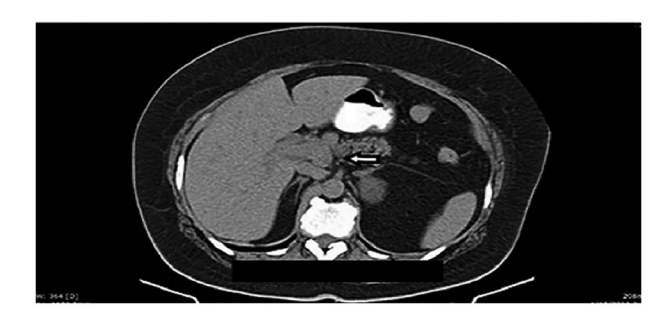
Figure 1. Computed tomography scan showing the 3.5x3 cm mass in the liver hilum (arrow).

Thereafter, diagnostic laparoscopy was undertaken to extract an adequate tissue sample for pathology. The mass in the liver hilum was identified during the operation, and a lymph node from the hepatoduodenal ligament was retrieved. The specimen was fixed in 10% neutral buffered formalin for 24 h at room temperature (RT), processed by routine methods and embedded in paraffin. For routine histology, sections were stained at room temperature for 30 min with hematoxylin (cat. no. CS700; Dako; Agilent Technologies, Inc.) and eosin (cat. no. CS701; Dako; Agilent Technologies, Inc.) in Dako Coverstainer (Dako; Agilent Technologies, Inc.) and studied under a light microscope (Nikon Eclipse E200; Nikon Corporation). Immunostaining was performed on 3-µm deparaffinized sections. Primary antibodies against CD3 (rabbit polyclonal, 1:300 dilution; Zytomed Systems GmbH), CD20 (mouse monoclonal, clone L26 1:100 dilution; Dako; Agilent Technologies, Inc.), Pax-5 (mouse monoclonal, clone DAK-PAX5, ready to use; Dako; Agilent Technologies, Inc.), CD5 (rabbit monoclonal, clone SP19/4C7, 1:200 dilution; Dako; Agilent Technologies, Inc.), CD10 (mouse monoclonal, clone 56C6, ready to use; Dako; Agilent Technologies, Inc.), Bcl-6 (mouse monoclonal, clone PG-B6P, 1:20 dilution; Dako; Agilent Technologies, Inc.), Bcl-2 (mouse monoclonal, clone 124, 1:40 dilution; Dako; Agilent Technologies, Inc.), MUM-1 (mouse monoclonal, clone MUM-1P, 1:40 dilution; Dako; Agilent