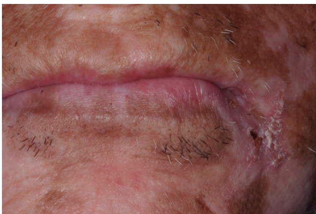
Figure 1 – Diffuse hypochromic and hyperchromic skin lesions characteristic of chronic cutaneous graft-versus-host disease.

An extra oral examination revealed diffuse hypochromic and hyperchromic skin lesions (Figure 1), and palpable submandibular and cervical lymph nodes. The oral examination revealed a very poor hygiene status, scleroderma with a severe limitation of mouth opening, severe mucosal atrophy and ulcerations, absence of tongue papillae, a pseudomembrane on the anterior third part of the left buccal mucosa, and an indurated retrocomissural ulcerated nodule of approximately 1 cm in diameter (Figure 2). The panoramic radiographic image showed residual root fragments and loose teeth (Figure 3).