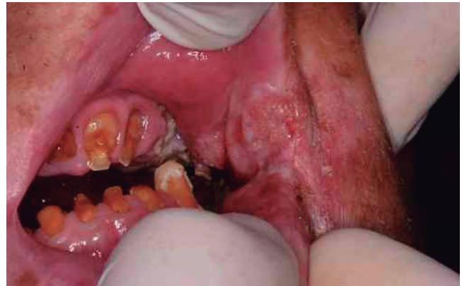
Figure 2 – Indurate and asymptomatic retrocomissural lesion. Poor oral hygiene was evident with multiple acute carious lesions, the accumulation of gross biofilm, gingivitis and restricted mouth opening.