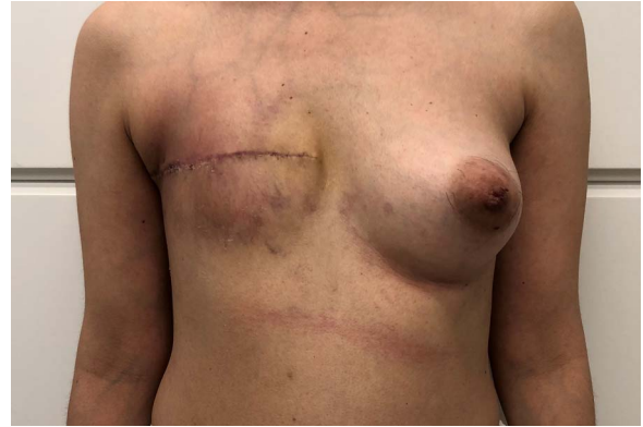
Figure 3: Two days after mastectomy and breast reconstruction with tissue expander.

Macroscopically, surgical margins were free. Reconstruction with tissue expander was decided and it was inserted beneath pectoralis major. Skin flaps were closed under some degree of tension after the placement of surgical drains. Postoperatively, the patient recovered with no complications (Fig. 3).