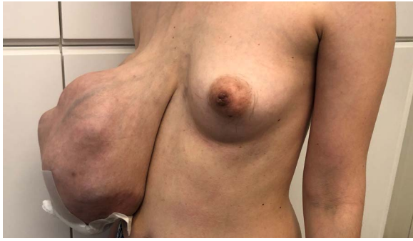
Figure 1: A 38-year-old female with phyllodes tumor occupying the right breast.