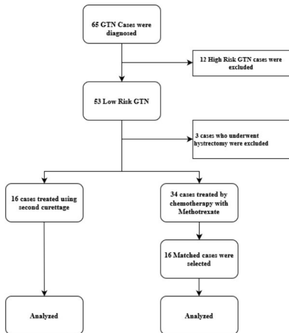
Figure 1. Patients' flowchart

GTN is diagnosed based on these criteria: 1) a rise in the \beta hCG assay of 3 consecutive measurements, or longer over at least a period of 2 weeks or more; days, 1, 7, 14"; or 2) "a plateau in the \beta hCG assay for four consecutive weekly levels over three weeks or longer; that is, days 1, 7, 14, 21"; or 3) the \beta hCG level remains detectable for six months or longer; or 4) histological diagnosis of choriocarcinoma.