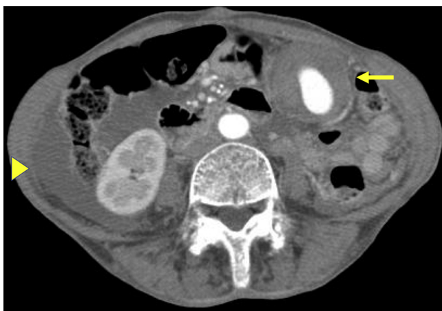
Fig. 1. Contrast-enhanced computed tomography scan showing a large aneurysm (arrow) and a moderate amount of intra-abdominal fluid collection (arrowhead).

complications. The ultrasonogram 3 months after TAE showed no blood flow to the GEAA in the outpatient department. The patient died of exacerbation of bronchiectasis at 5 months after TAE.