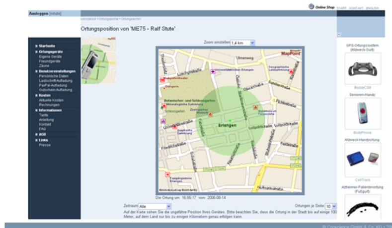
Figure 2 Corscience mobile GPS tracking system. Diagram showing the main components of Corscience mobile GPS tracking system.