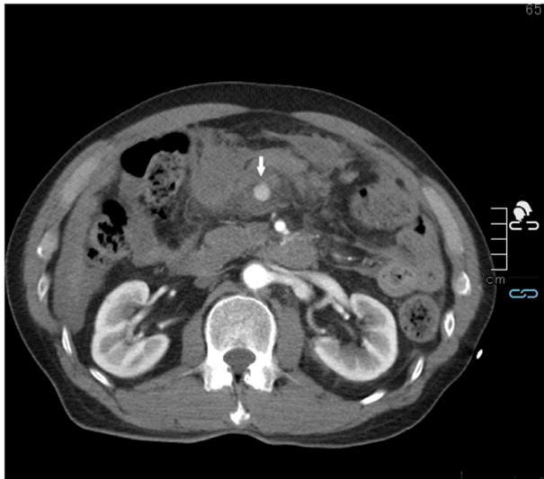
Fig. 1 – Contrast-enhanced computed tomography scan showed a pseudoaneurysm (arrow) and mesenteric hematoma.