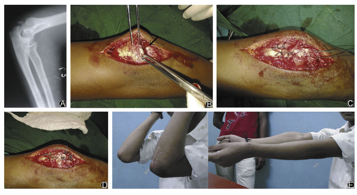
Fig. 1. A: Lateral X rays of left elbow showing flake sign. B: Arrow showing site of rupture. C: Krackow suture in the aponeurosis passed through holes in olecranon. D: Final repair. E: Elbow range of motion at one year follow up.