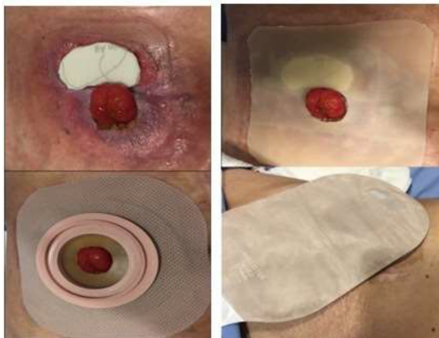
Figure 5 Treatment of stomal lesion.