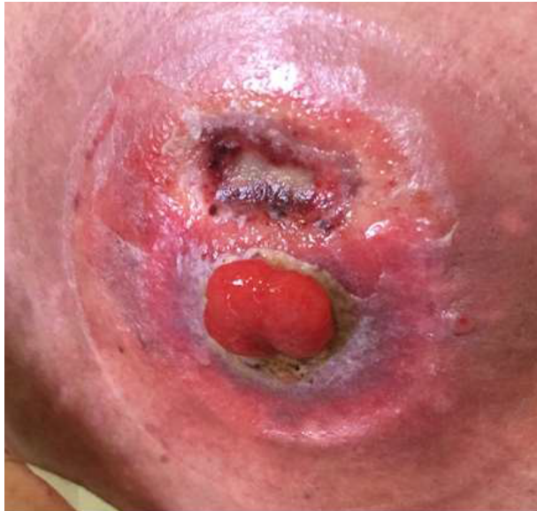
Figure 3 An increased degree of inflammation of the stomal lesion seen on the day of grafting.

performed through the ileostomy prior to HSCT was very difficult because the colonoscopy did not progress sufficiently to gain an adequate view due to the external lesions and stenosis. One year later, there was a marked improvement, and it was possible to see the lesions better. Thus, as the score related to the circumference of the ulcers did not change substantially, the disease persists from the endoscopic point of view even