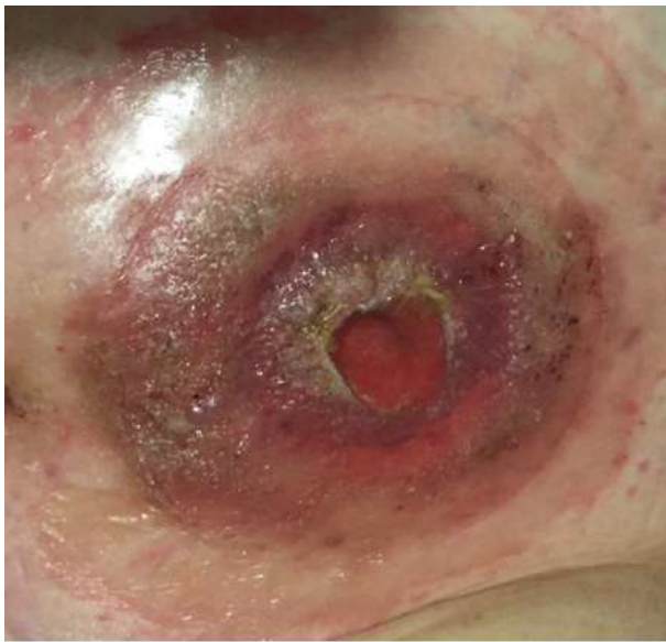
Figure 1 Dermatitis around the stoma before hematopoietic stem cell transplantation.