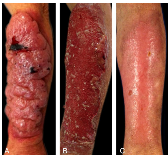
Figure 1 (A) Friable tumor with a mucoïd aspect; (B) Post-detachment of the mucoïd and necrotic plaque; (C) Healing at 120 days.

tion is polymorphic (papules, purpura, vesicles/blisters, pustules, nodules, tumors, ulcerations, necrotizing panniculitis/cellulite, abscesses, acne-like lesions and molluscum contagiosum-like lesions), and can delay the diagnosis and lead to unfavorable outcomes. 1-7