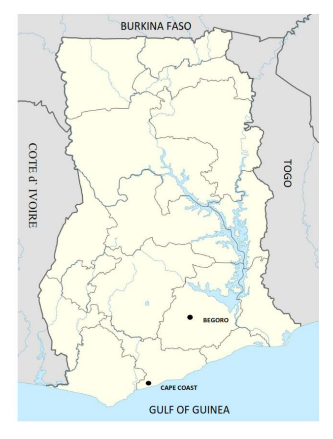
Figure I The map of Ghana showing the two study sites (black dot) within different ecological zones: Begoro in the forest area and Cape Coast in the coastal savanna area.

The antimalarial drugs used in this study included chloroquine (CQ), amodiaquine (AMD), artesunate (ART), mefloquine (MFQ) and dihydroartemisinin (DHA). These drugs were