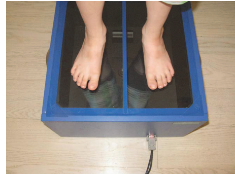
FIGURE 1: Podoscopic survey sample. The authors obtained the participant's parent consent to publish the image.

the point lying most laterally on the head of the V metatarsal bone (metatarsale fibulare: mtf) in cm;