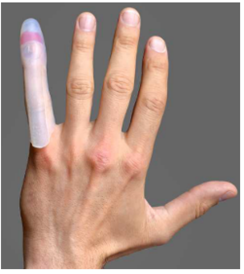
Figure 1: Photograph of silicone finger cap

the way to the base of the finger cap thus splinting the injured finger enough to care for undisturbed healing while allowing some movement in all finger joints. A reservoir for excess wound fluid is connected to the wound chamber by capillaries, thus enabling free diffusion in between the wound and the reservoir (Figure 1, Figure 2). This reservoir can be punctured with a regular injection needle. The used medical silicone (Dragon Skin Series Part A&B from the company KauPo, Silastic® 07–4720 Biomedical Grade ETR Elastomer and Silastic® 07-4765 Biomedical Grade ETR Elastomer both from the company Dow Corning) is permeable to oxygen to some extent but impermeable to water vapour. For this series all finger caps were individually handcrafted by Orthopedic and Rehabilitation Engineering Dresden (ORD), Dresden, Germany.