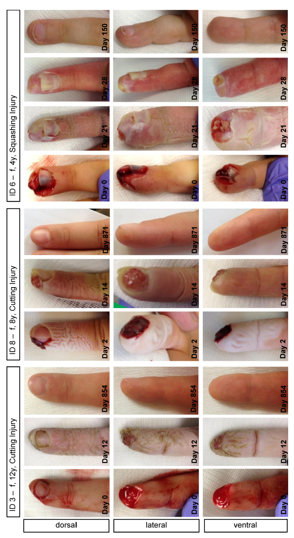
Figure 4: Photo documentation during clinical course and outcome at follow-up of three exemplary patients treated with silicone finger cap

In two cases there was a minimal residual non-adherence of the nail body to the distal nail bed. Only in two cases we saw an interruption of the regularly regenerated pattern of dermal ridges by a small scar. Epithelialization time reached from 20 to 36 days in the patients treated with a finger cap. Where data was available, film occlusions were found to be equally successful with epithlialization times from 6 days to 36 days (Table 2).